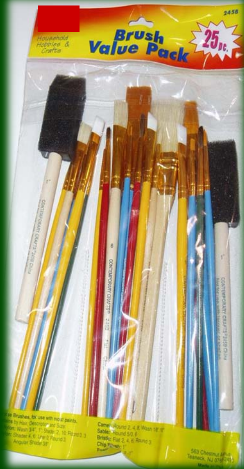
Location of Quantity